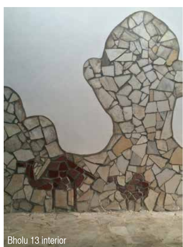
Bholu 13 interior