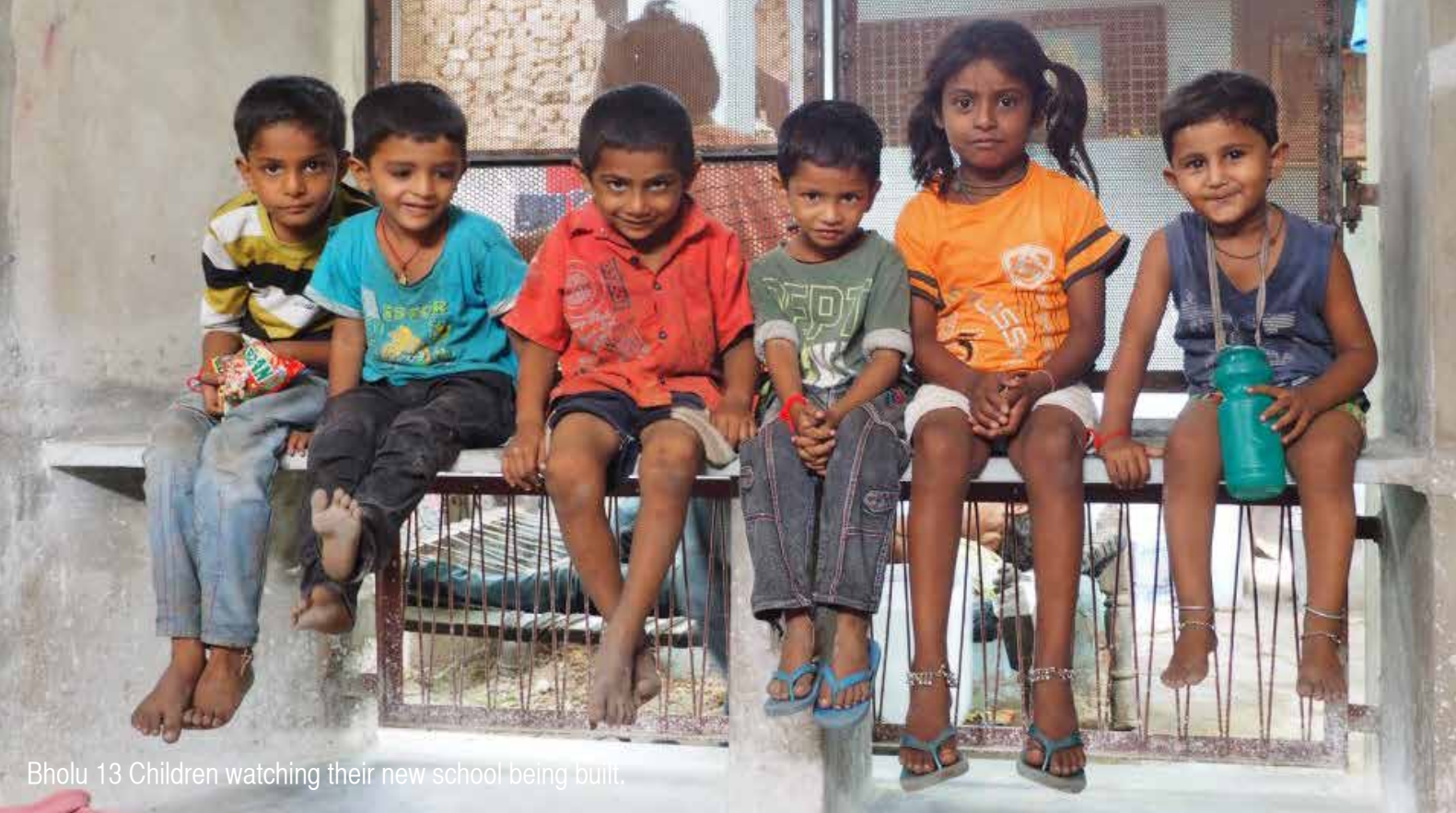
Bholu 13 Children watching their new school being built.