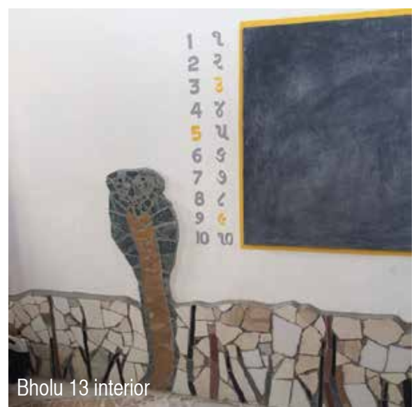
Bholu 13 interior