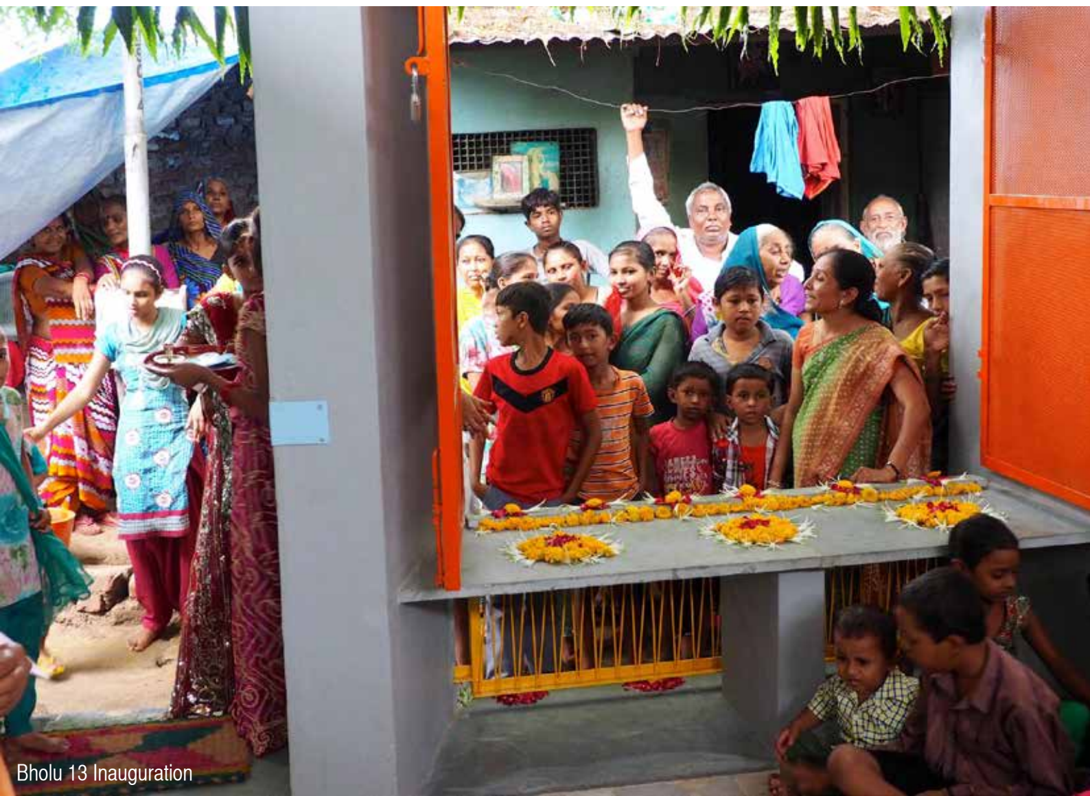
Bholu 13 Inauguration