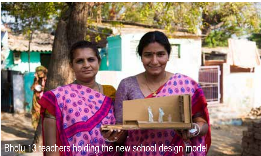
Bholu 13 teachers holding the new school design model