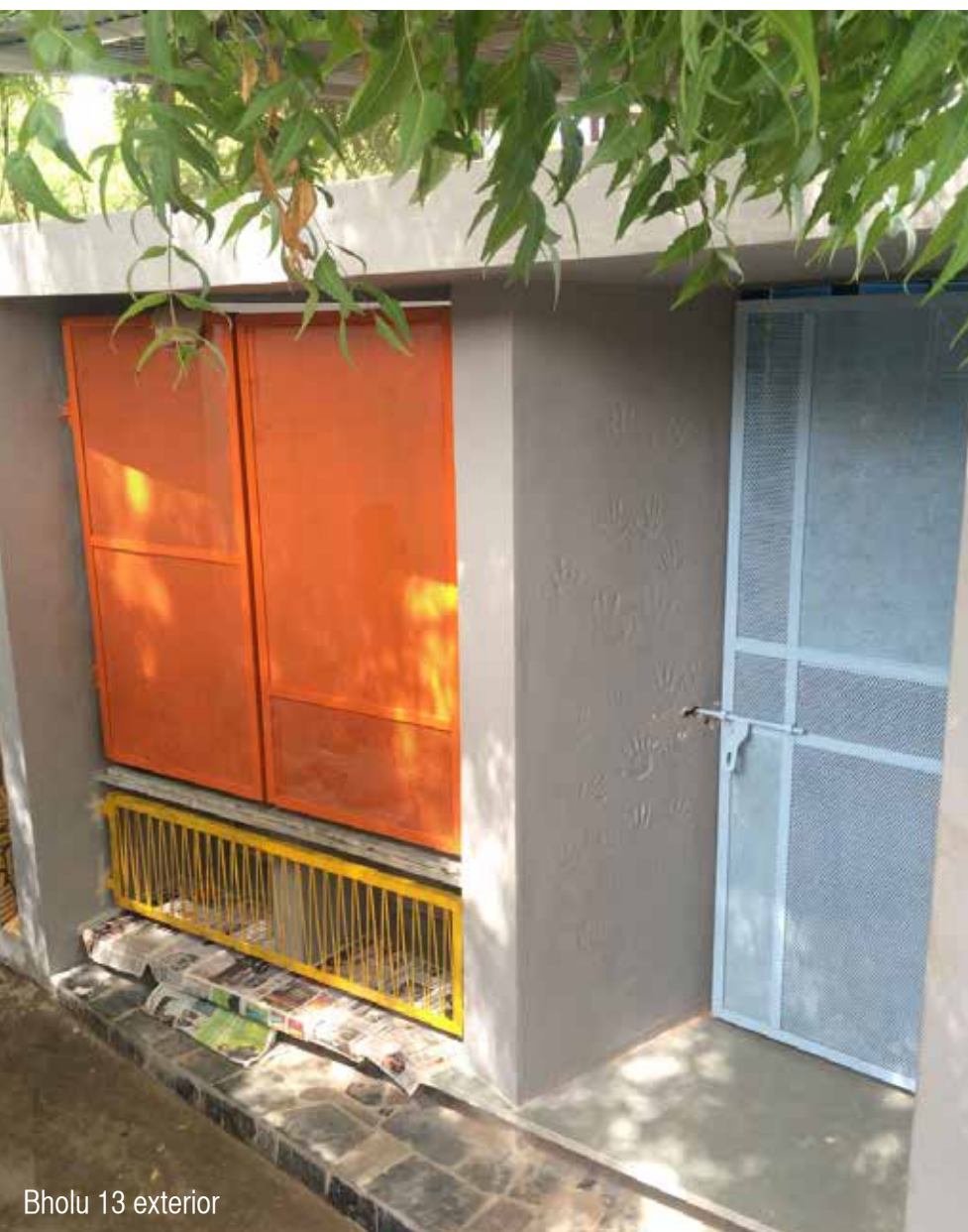
Bholu 13 exterior