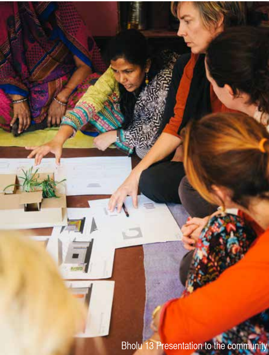
Bholu 13 Presentation to the community