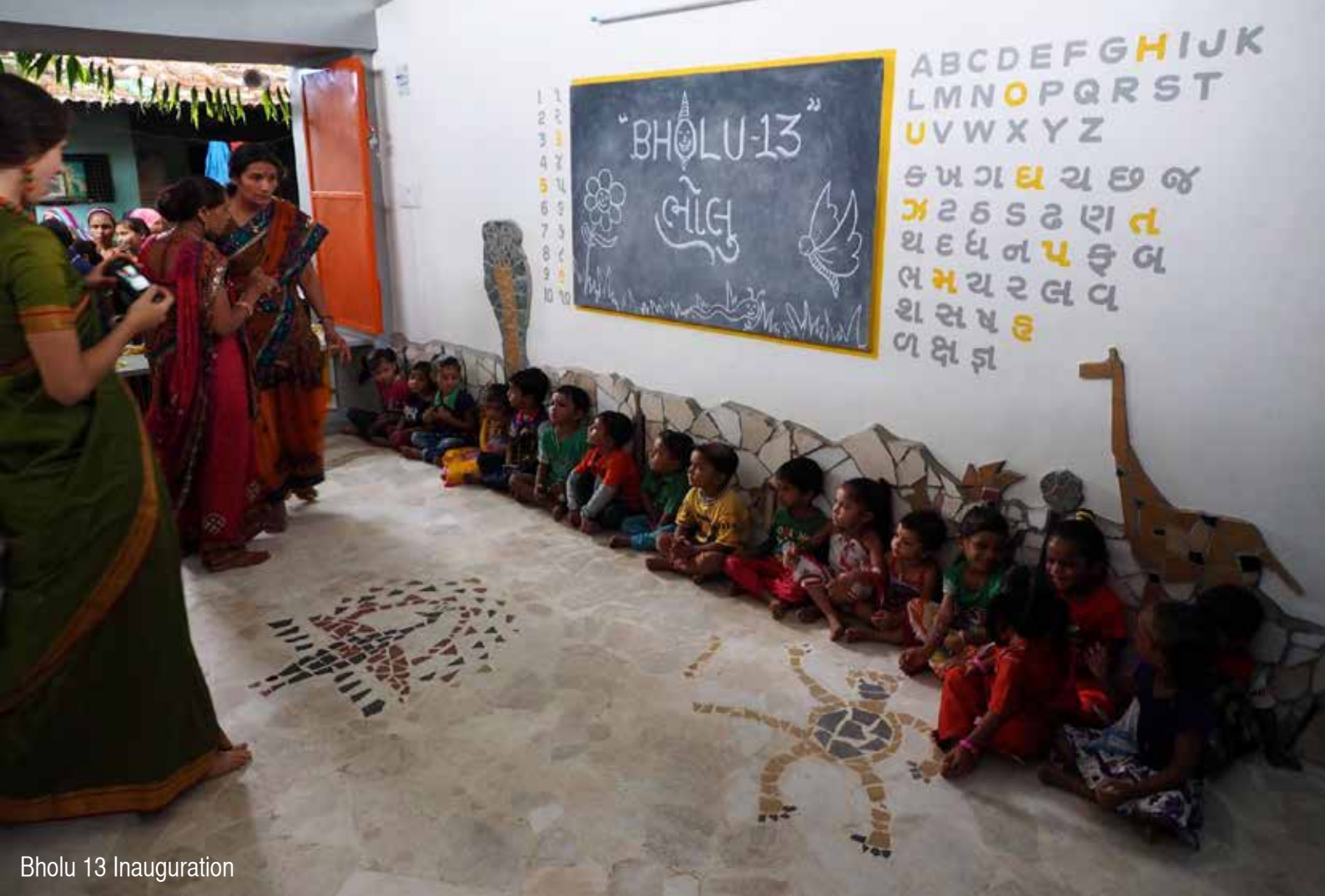
Bholu 13 Inauguration