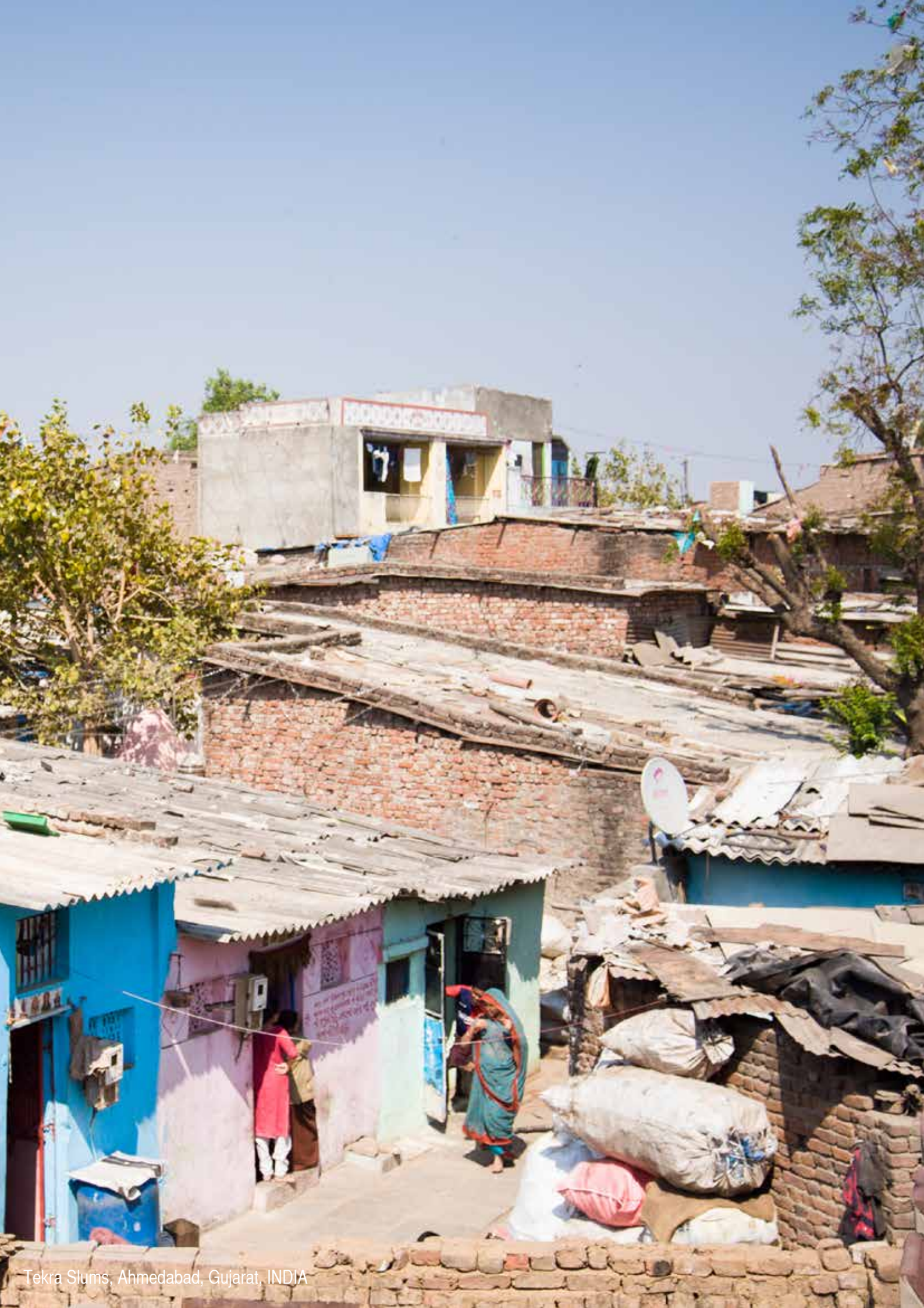
Tekra Slums, Ahmedabad, Gujarat, INDIA