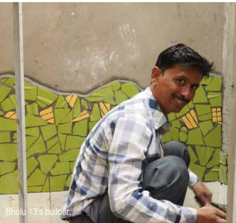
Bholu 13's builder.