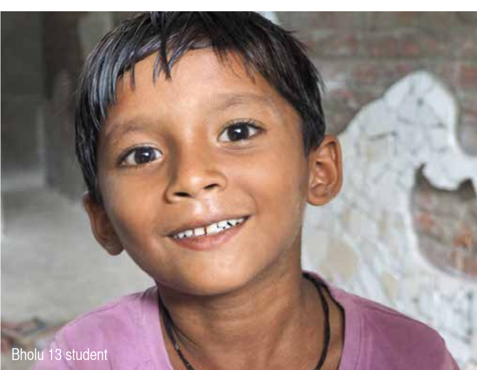
Bholu 13 student