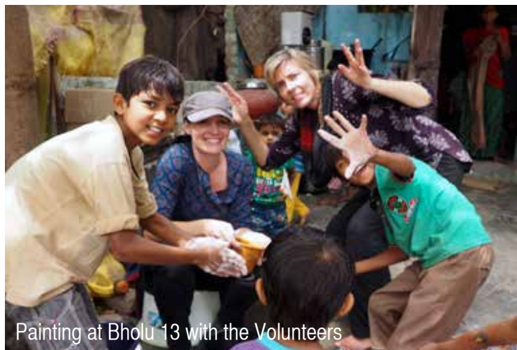
Painting at Bholu 13 with the Volunteers