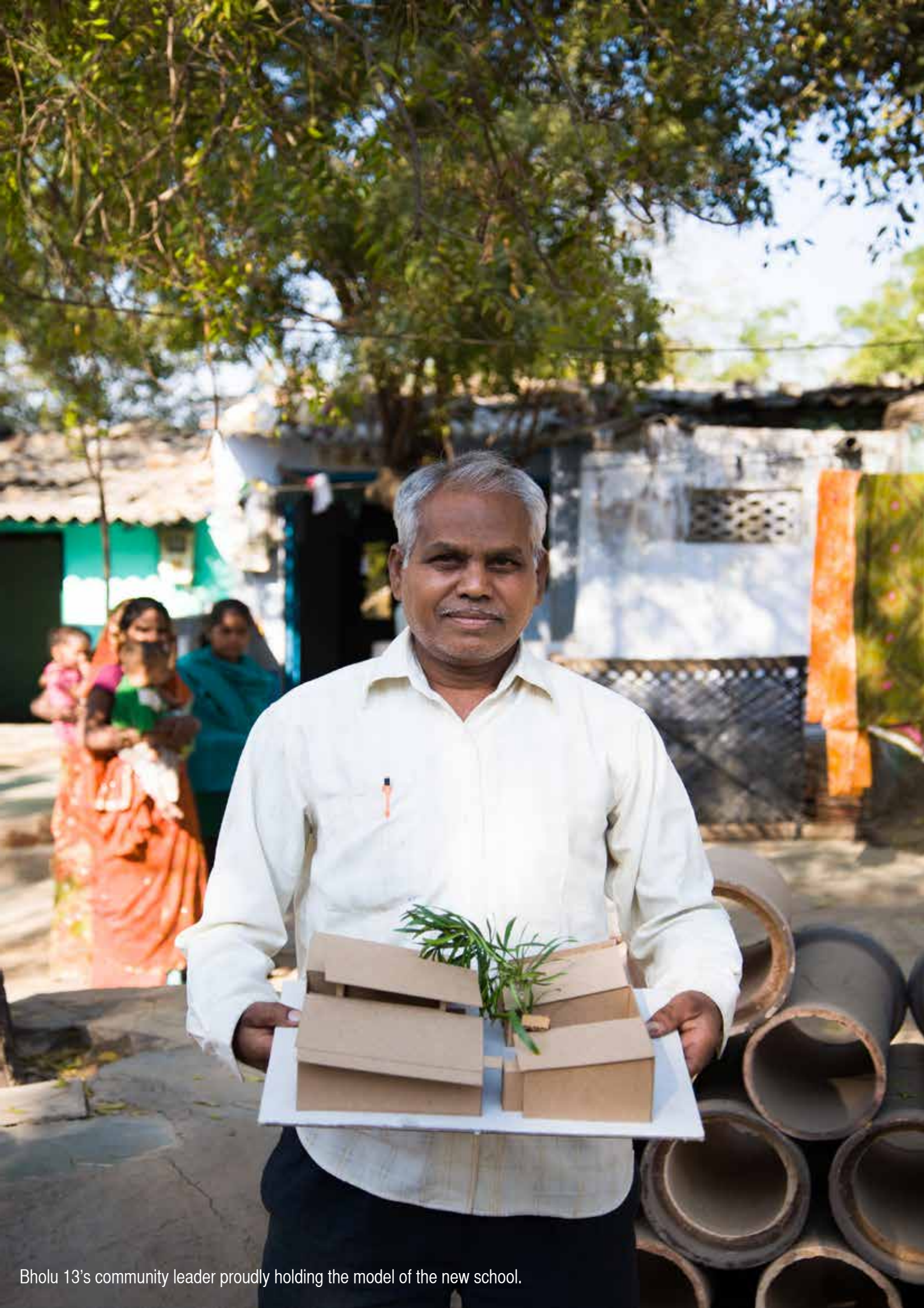
Bholu 13's community leader proudly holding the model of the new school.