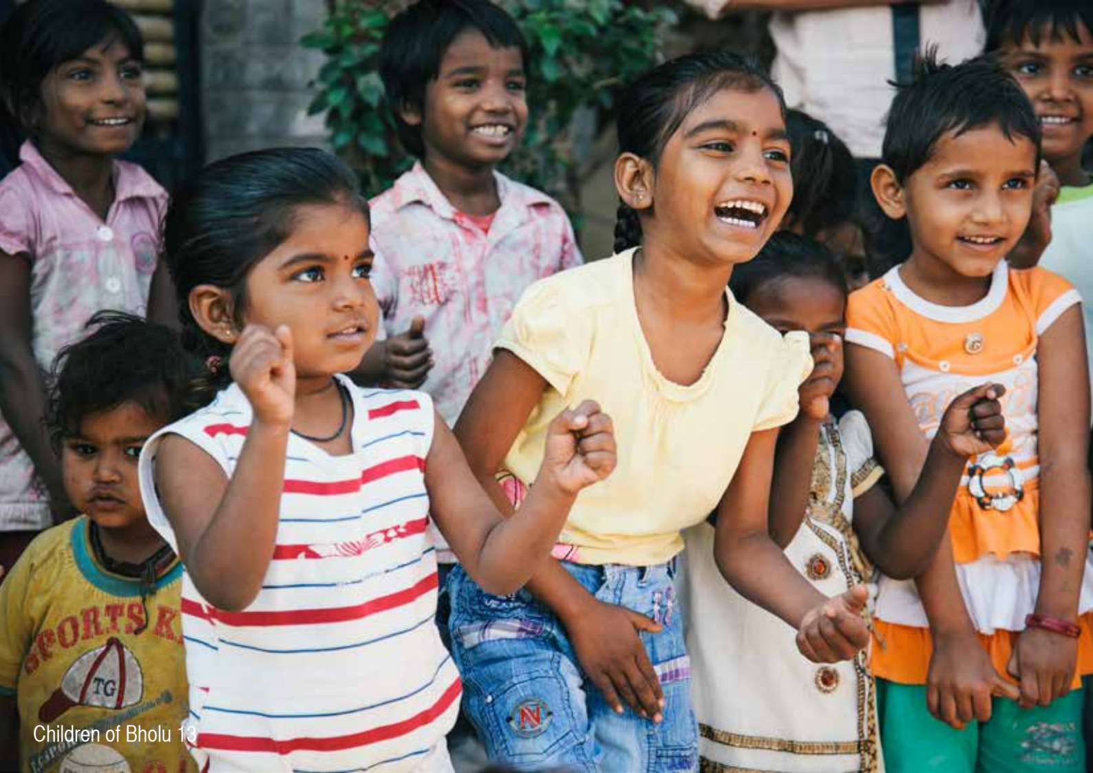
Children of Bholu 13