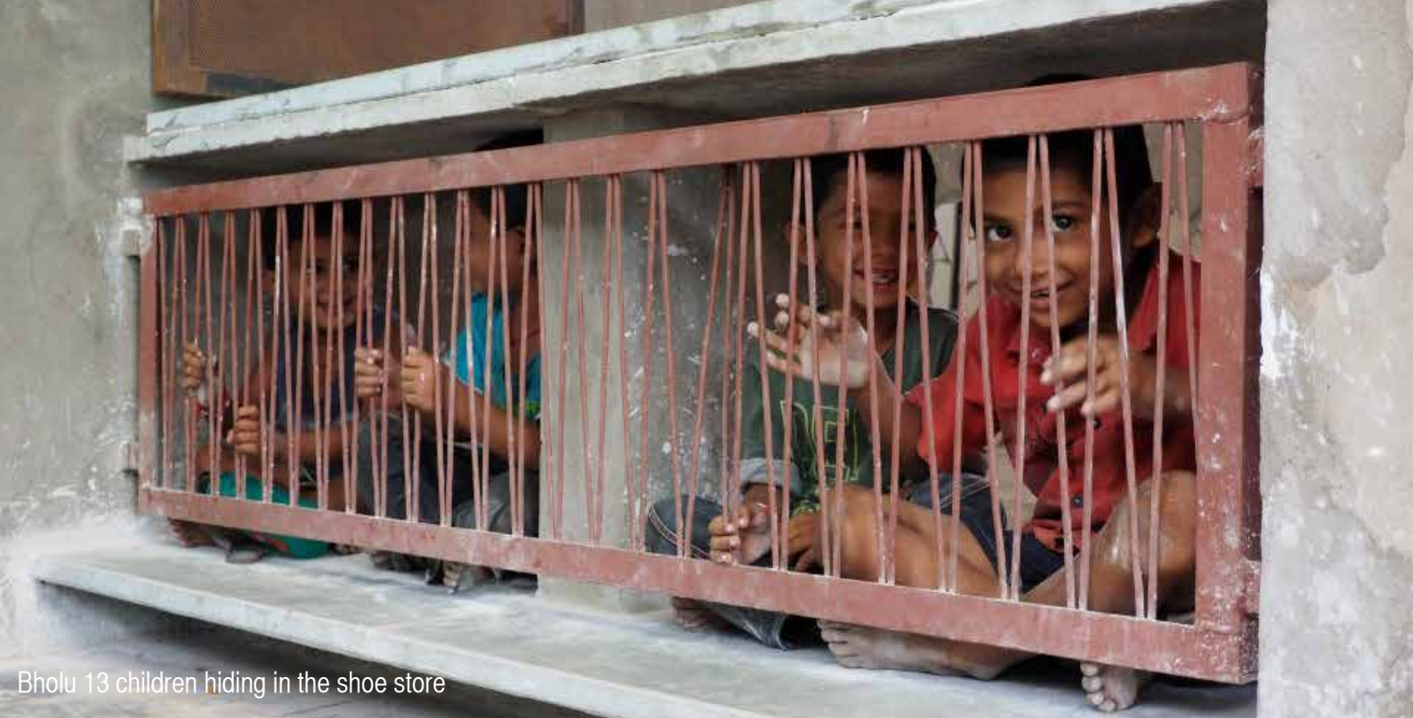
Bholu 13 children hiding in the shoe store