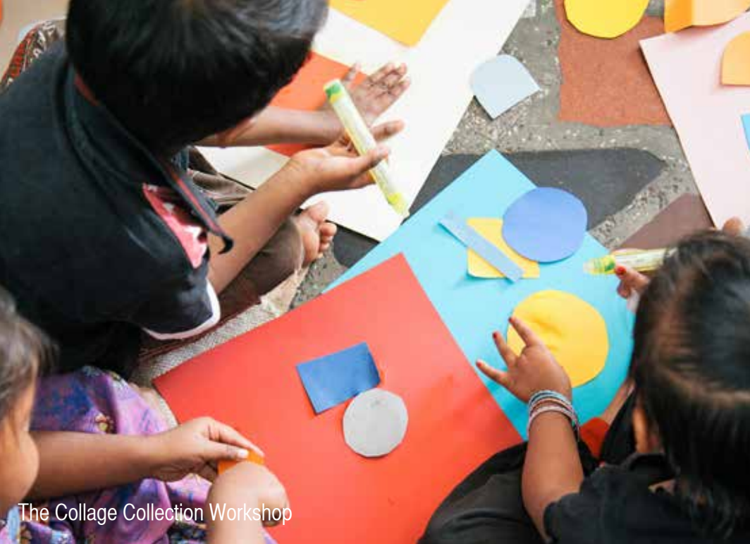
The Collage Collection Workshop