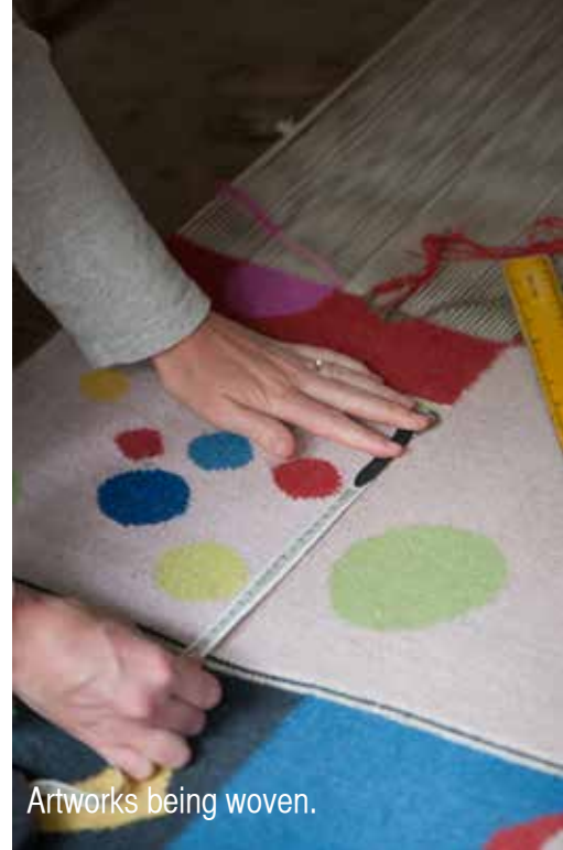
Artworks being woven.