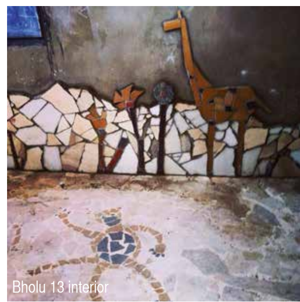
Bholu 13 interior