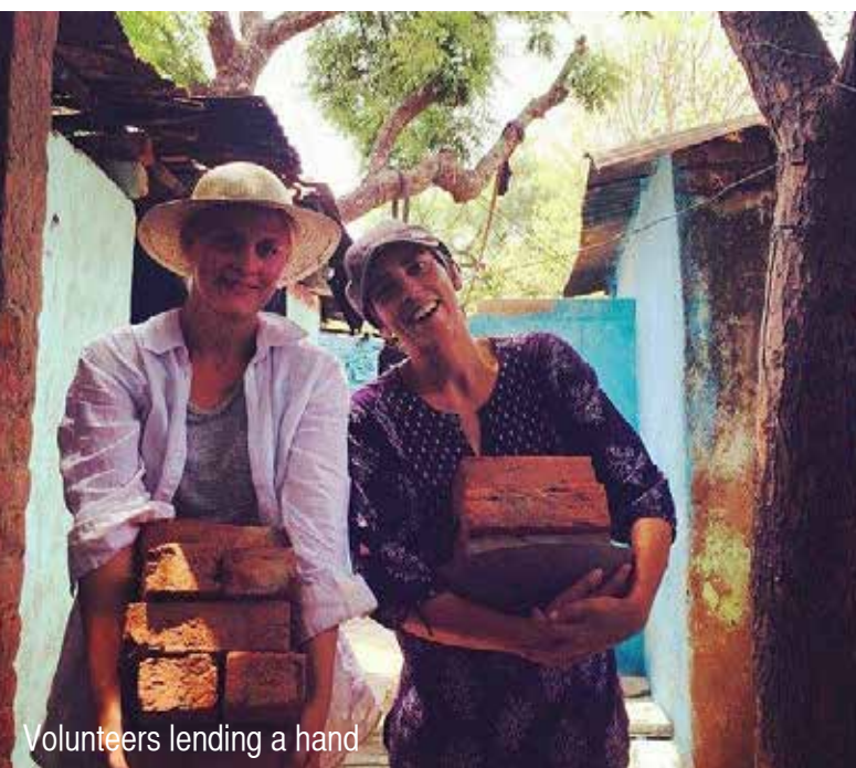
Volunteers lending a hand