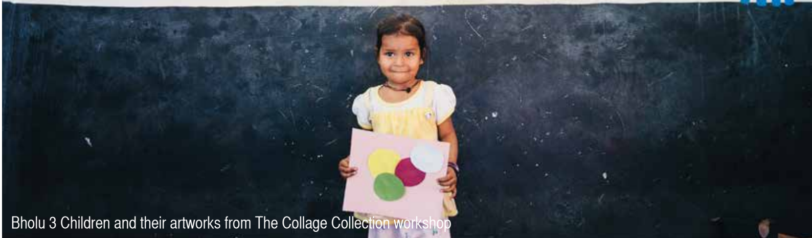
Bholu 3 Children and their artworks from The Collage Collection workshop