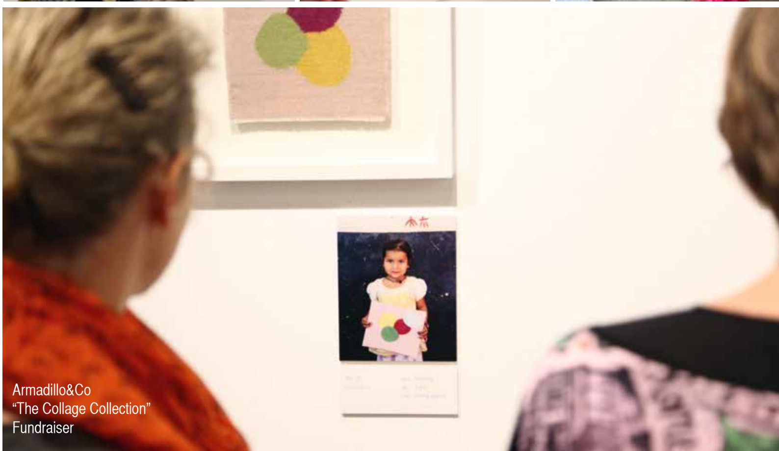
Armadillo&Co "The Collage Collection" Fundraiser